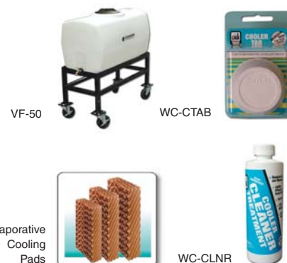
Evaporative Cooling Pads