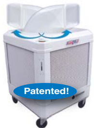
WC-1HPMFOSC Spout oscillates 120°

Spot cool your deck, patio or work area with high performance, environmentally friendly WayCool® evaporative coolers.